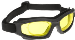
#50 Goggle w/ Insert