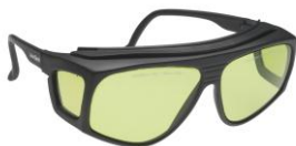
#31 Small / #39 Large Universal