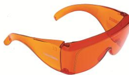
#700 Medium / #900 Large