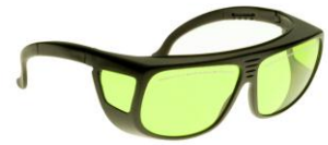
#36 Medium / #38 Large Universal